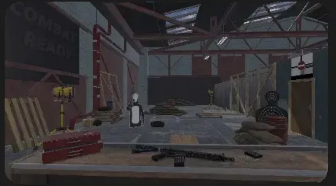
CQB ARENA 2