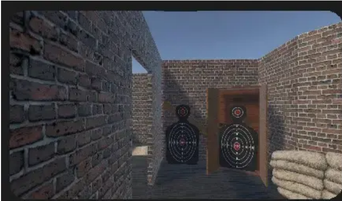
CQB ARENA 1